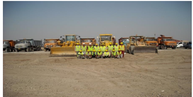
Team IPC at Sather Air Base