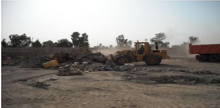
Phase 1 DynCorp LSA Site Preparation