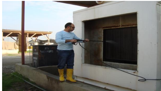
Keeping them clean