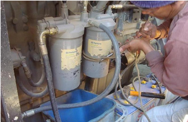
Changing out filters