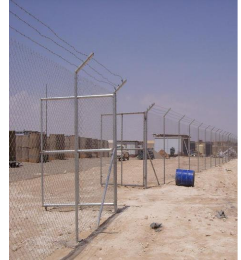
Fence & Parking Lot Project (Before & After)