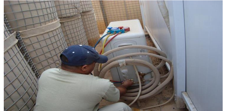
Performing AC checks