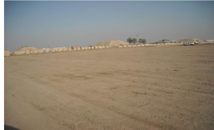
Ready for Inspection