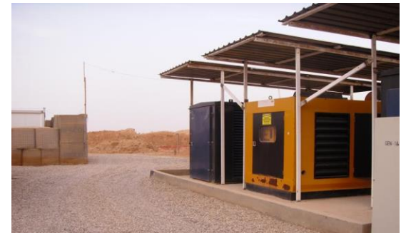
Mesa Generator Area before and after