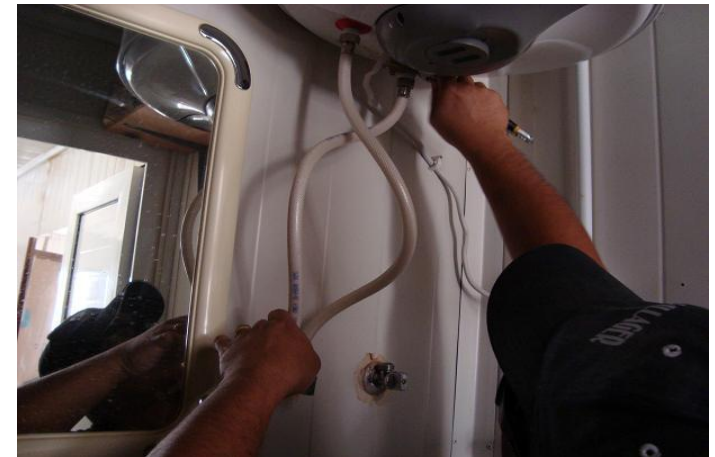
Installing new hoses for a water heater