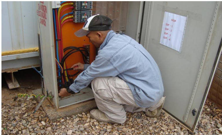
Grounding and bonding all DB's IAC with NEC 2008