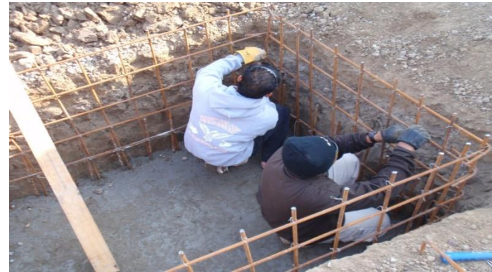
Concrete work at Camp Butler