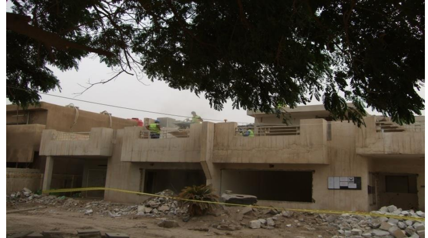
JA Villa IZ Construction Project