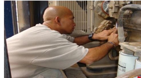
Mesa Supervisor performing Generator maintenance