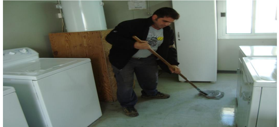
Keeping the Laundry Room clean