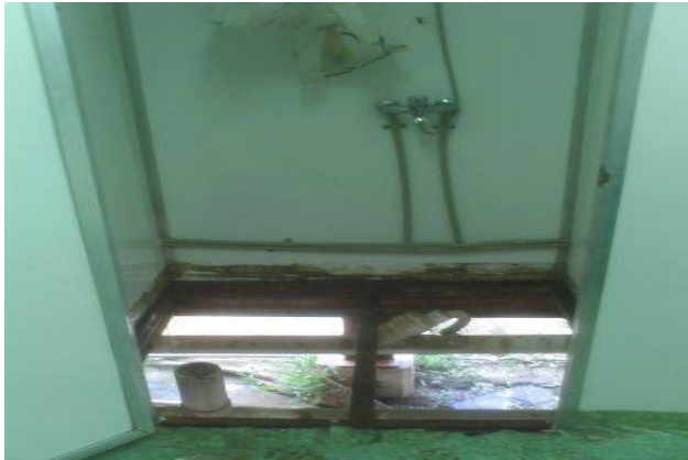
Water damaged shower floor (Before)