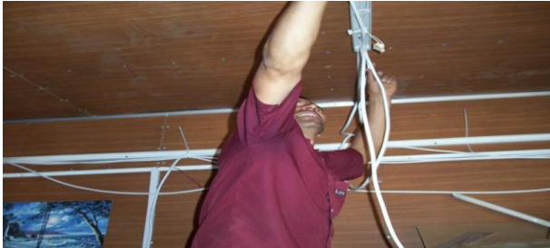
Placing spacer's between the lights IAC with TFS