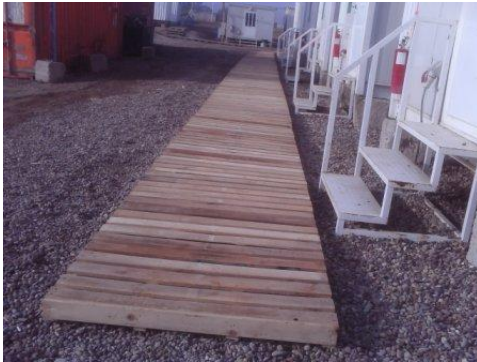
Sidewalk at Camp Klecker