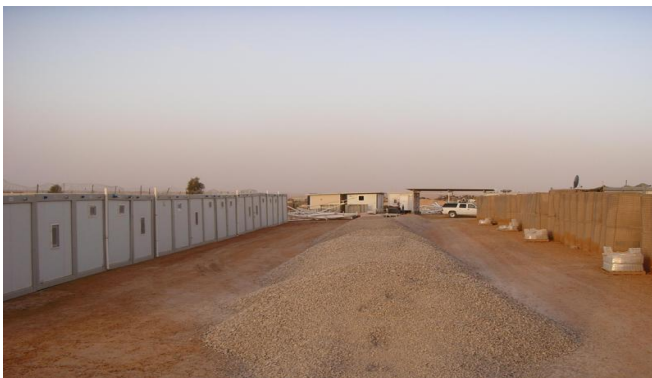
Gravel landscaping at Camp Mesa